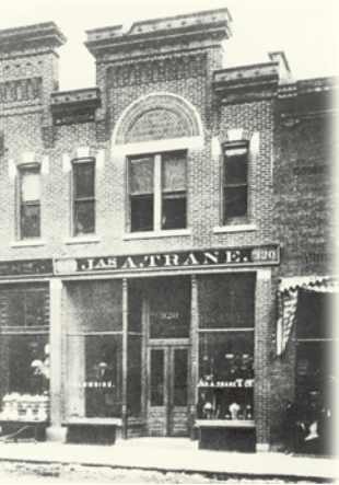
Trane Storefront La Crosse, Wisconsin 1891